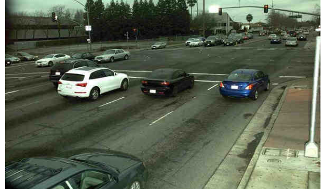
Location: SAC-HOHU-01 N/B Howe Ave And Hurley Way, Sacramento Ca. (v4.12.98.0) Date: Saturday 20 December 2014 Time: 13:07:01 Frame: 5 SpeedLimit: 40 MPH Lane: 4 Vehicle Spd: 33 MPH RED 1.98 Elapsed Time: 0.94 Amber:4.81