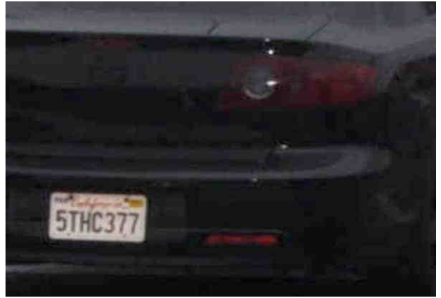
Location: SAC-HOHU-01 N/B Howe Ave And Hurley Way, Sacramento Ca. (v4.12.98.0) Date: Saturday 20 December 2014 Time: 13:07:01 Frame: 5 SpeedLimit: 40 MPH Lane: 4 Vehicle Spd: 33 MPH RED 1.03 Elapsed Time: 0.00 Amber:4.81